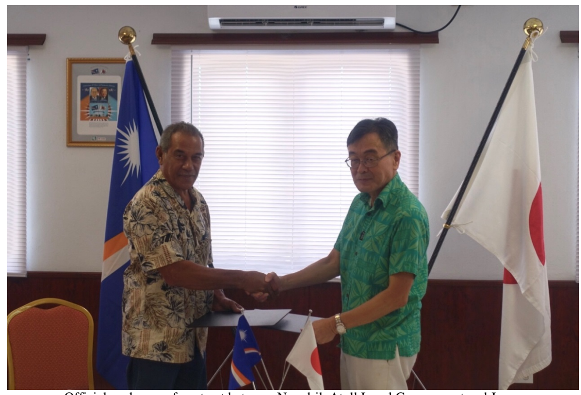
Official exchange of contract between Namdrik Atoll Local Government and Japan